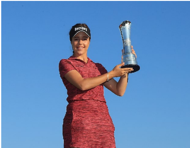
Georgia Hall, Champion 2013