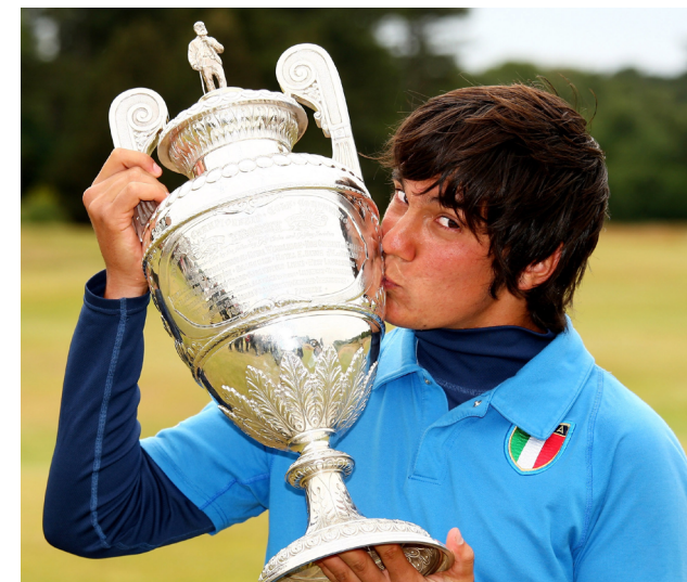
Matteo Manassero, 2009 Champion

MATTEO MANASSERO became The Amateur's youngest winner when he carried off the title at Formby in 2009. He is a four-time DP World Tour winner, a tally that includes the 2013 BMW PGA Championship.