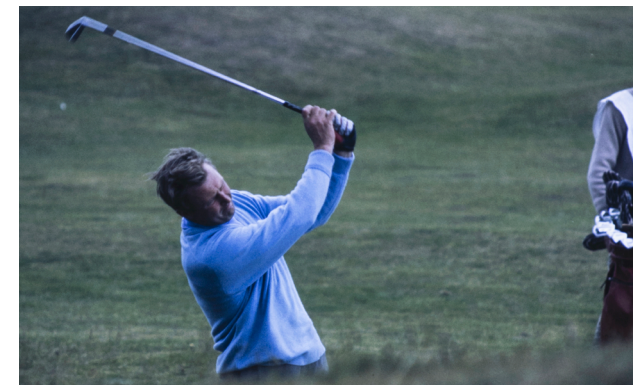
Sir Michael Bonallack, Champion 1968 - 1970

OLDEST CHAMPION: The Honourable Michael Scott was 54 and a grandfather when he won the 1933 Championship at Royal Liverpool.