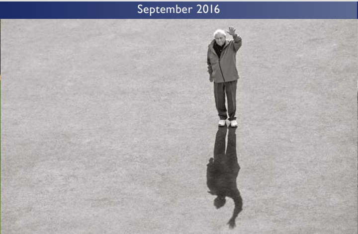
passing aged 87