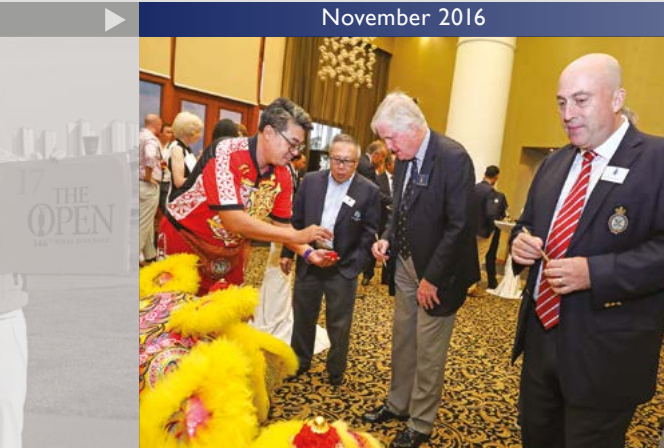
The R&A opened a new office at Sentosa Golf Club in Singapore