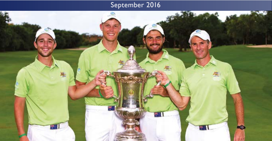
Australia won the Eisenhower Trophy at the World Amateur Team Championships in Mexico