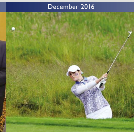
The R&A and Ladies' Golf Union completed Winner of the Latin America Amateur the merger of the two organisations