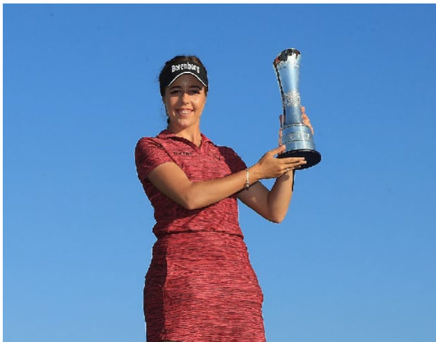
Georgia Hall, Champion 2013

CECIL LEITCH and JOYCE WETHERED dominated the championship between 1914 and 1929, winning the title four times each to share the record for most victories. They appeared against each other in three finals (1921, 1922 and 1925) with Wethered holding a 2-1 advantage. Wethered came from a famous golfing family. Her brother Roger finished second in The Open in 1921 and won The Amateur Championship in 1923.