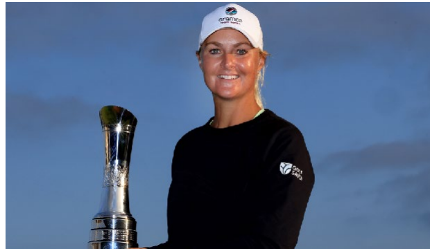
Anna Nordqvist, Champion 2008