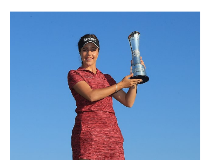
Georgia Hall, Champion 2013